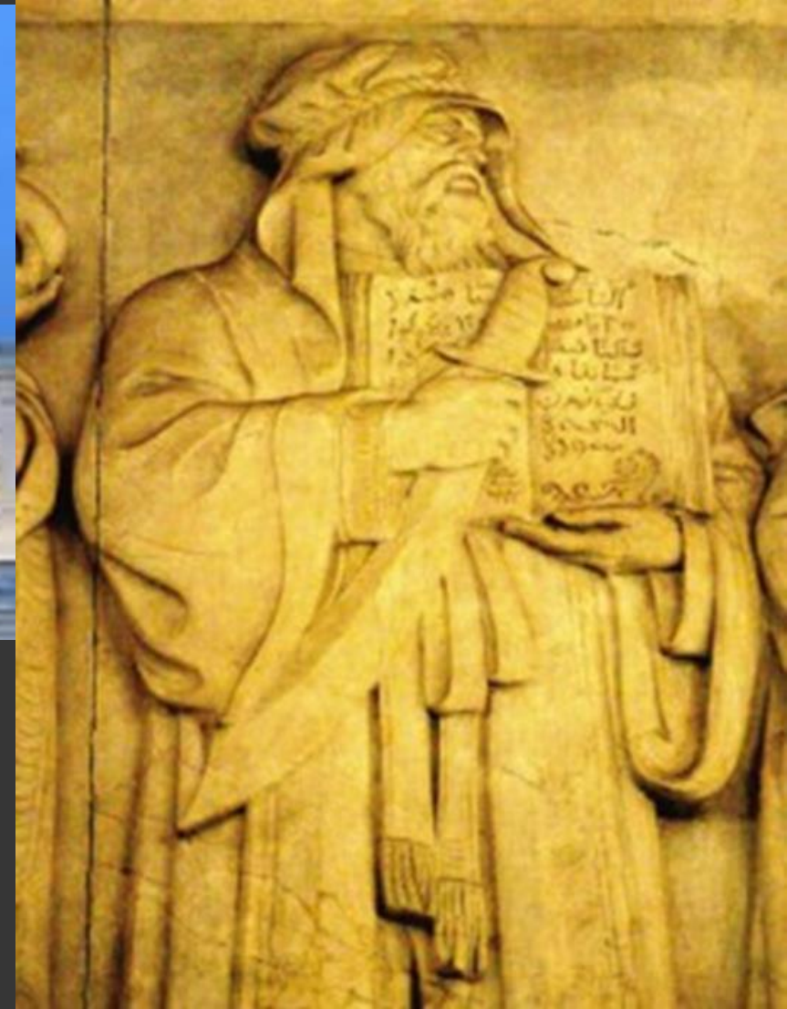
Prophet's Marble statue preserved on the Rotunda of the building since 1930 holding Qur'an

Where else can you practice Islam better than USA?