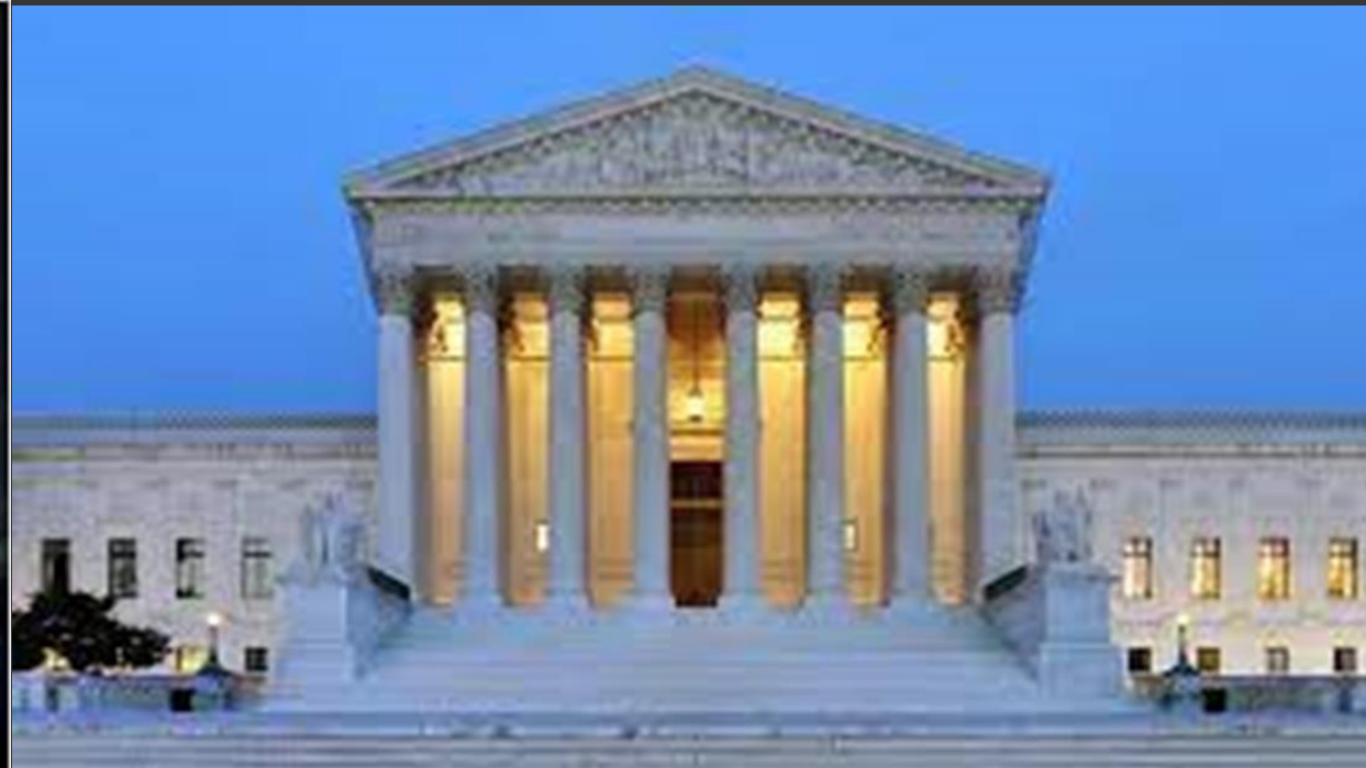
United States Supreme Court