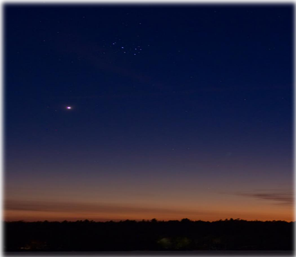
Picture Star after sunset