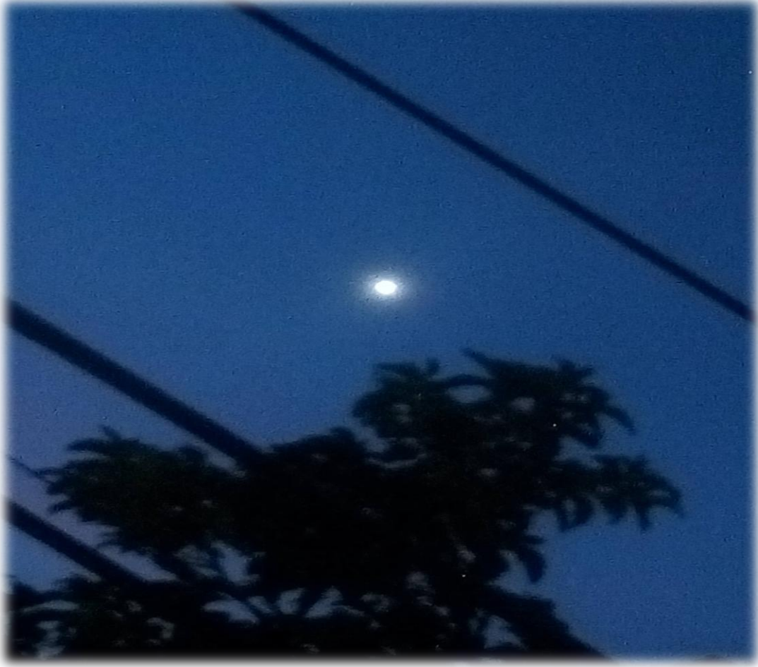
Picture Star before sunrise