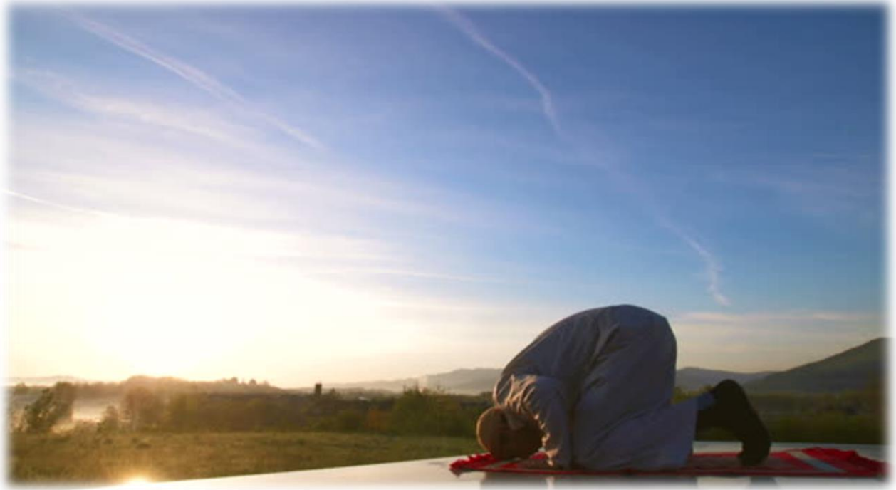
Picture of man Prostrates

5. Do you not see that to Allah Prostrates whoever is in the heavens and whoever is on the earth and the sun, the moon, the stars, the mountains, the trees, the moving creatures and many of the people?